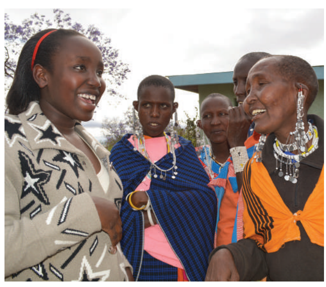
MADRE partners at a workshop in Tanzania.

In Yemen, MADRE partner Food4Humanity brokered peace between two communities at war. Our partners then went even further to cement the trust and collaboration between these communities: they worked with them to build a new school for their girls that opened in November 2019. The school opens a path to learning for girl survivors of war and demonstrates that peace is possible, even among communities mired in conflict.