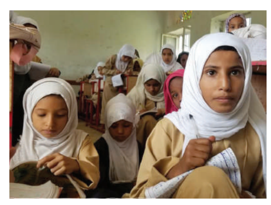
Girls at the local school in Yemen.