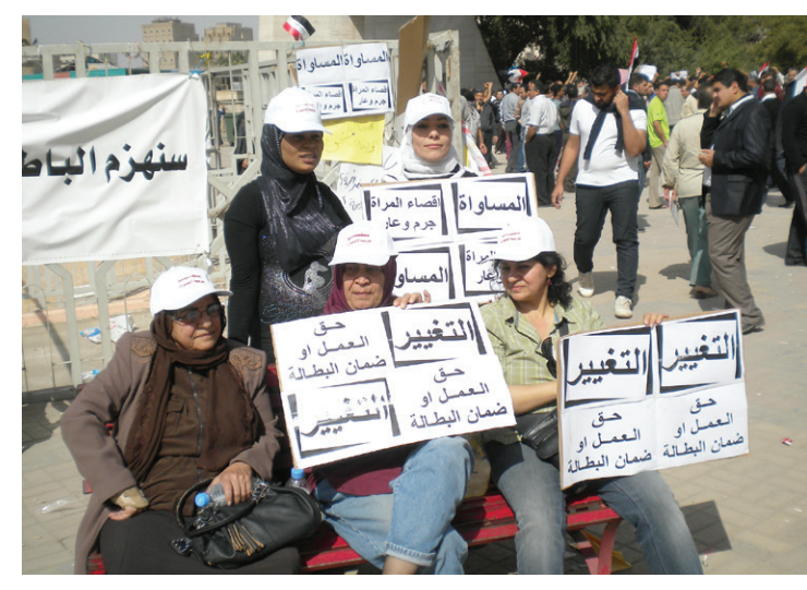
MADRE's partners, OWFI, protest during the Arab Spring in 2011.