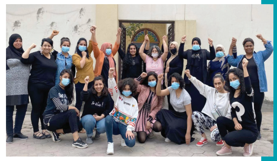
MADRE partner, the Organization of Women's Freedom in Iraq.

Go to MADRE.org/ways-give to learn how you can become a Lifeline member by giving monthly, donate stock through a donor-advised fund, or join our planned giving program.