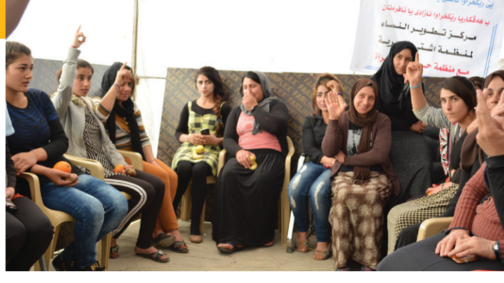
Women in Iraq meet at a workshop run by MADRE partner, OWFI.