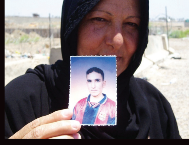
Women in Iraq have suffered so much loss during conflict.

Supporting Our Partners for the Long Haul