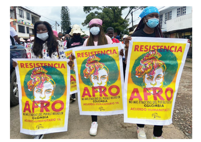
Activists from PCN take to the streets to hold the Colombian government accountable for the worsening humanitarian situation and its militarized response to protesters. @PCN

Comunidades Negras (PCN), who continue to advocate for a peaceful, sustainable resolution to the conflict. Despite a landmark peace agreement signed in 2016, the war has not ended. Communities still face human rights abuses, and activists for peace and social justice have faced violence and death threats.